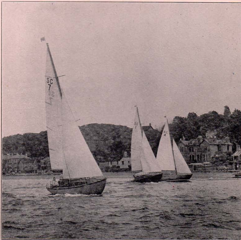
COWES - CHERBOURG 1956